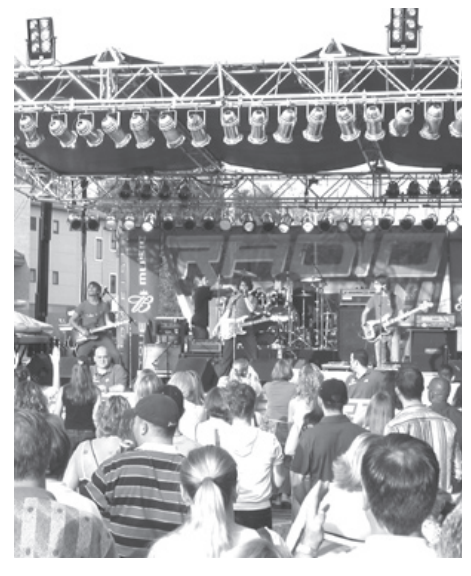
The stage on Westfield Blvd. presented live music from many bands.