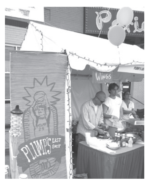
Plump's Last Shot offered Wings and Tenderloins, with a touch of tiki torches.

in the historic building on the northeast corner of Guilford and Westfield Blvd. Some of the fixtures are original to the Lobraico's Drug Store. A prominent original fixture still