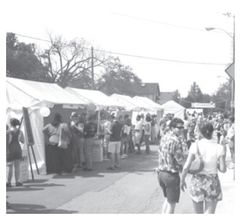
The Taste offered menu selections and specialties from local restaurants.

This year more restaurants will offer their specialties, including: Applebee's, Bleeker Street, Broad Ripple Brew Pub, Broad Ripple Steak House, Chumley's Grill, Circle City BBQ, Corner Wine Bar, Dick's Bodacious BBQ, The Jazz Cooker, The Jazz Kitchen, La Bamba's, Midtown