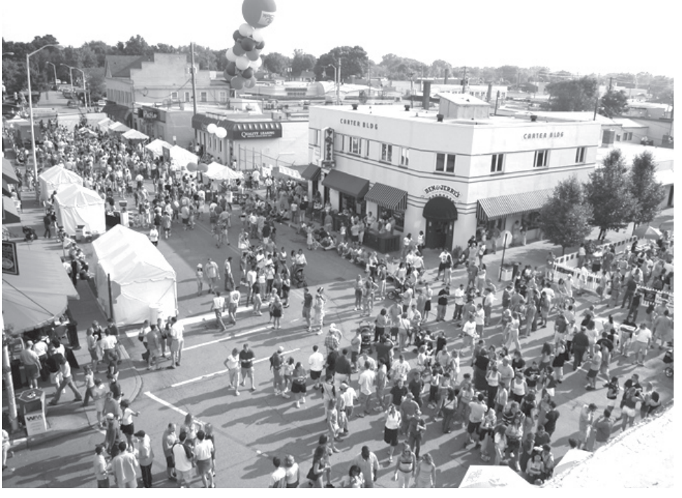
A view from atop Chelsea's during the 2003 Taste of Broad Ripple, looking south on Guilford. Food tents line the streets. The beer garden is to the right on Westfield Blvd.